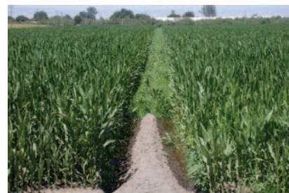
Irrigating with lagoon water