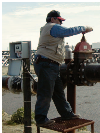
Adjusting the flow meter

Crops grown in the Central Valley are typically irrigated every 7 to 10 days in the summer. Synchronized rate nutrient application involves determining how much nitrogen the crop needs according to its stage of growth and injecting into the irrigation water just the amount of lagoon liquids that will supply the crop with the amount of nitrogen the crop will need between the current and next irrigation.