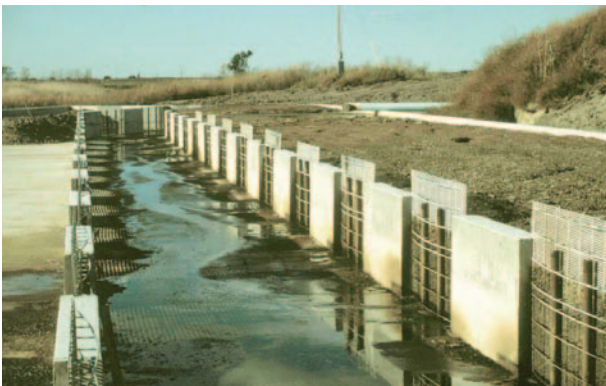
Weeping wall basin