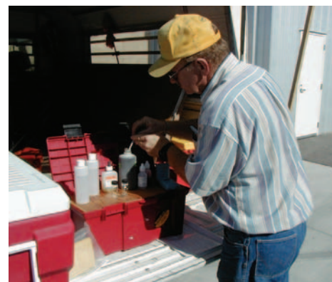
Measuring lagoon water nutrients with a nitrogen quick test

Other Central Valley producers report cost savings associated with not having to purchase commercial fer-